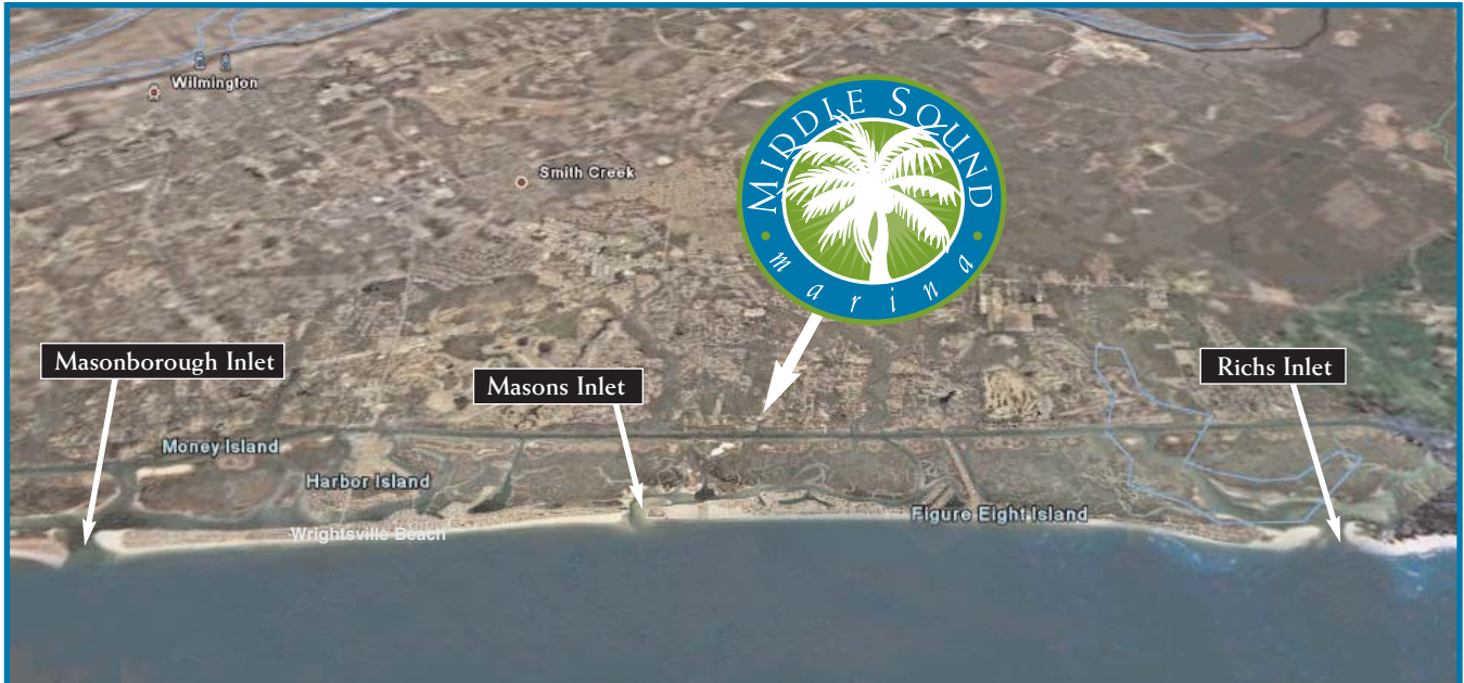
Ocean View of Major Inlets & Middle Sound Marina