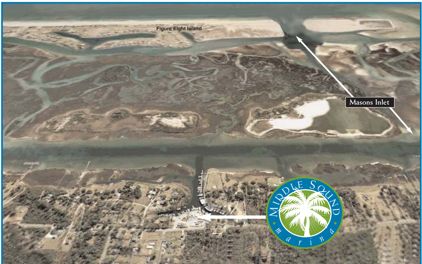
Southeast View from Middle Sound Marina Overlooking Figure Eight Island & Masons Inlet